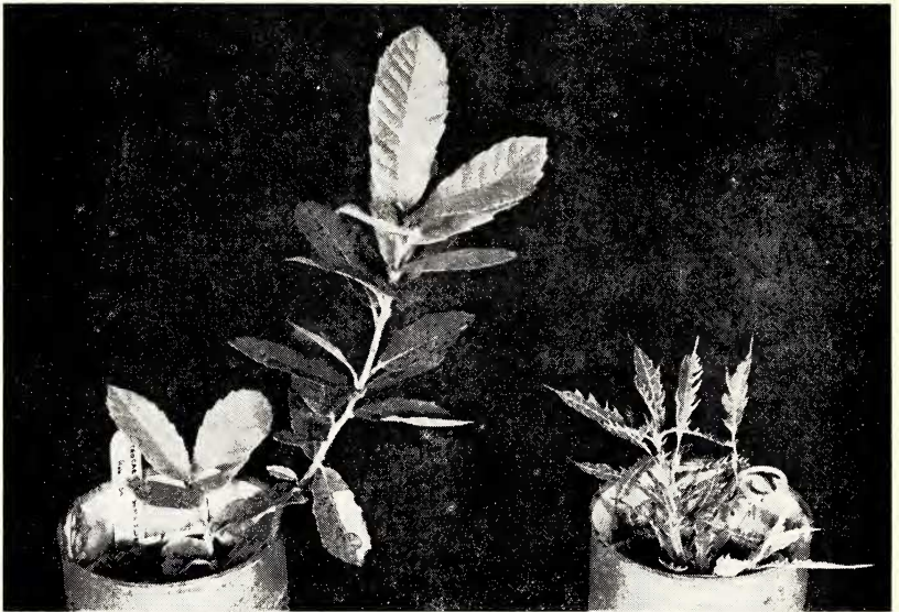
FIG. 3. Progeny from Lithocarpus densiflorus parent tree 0-5—a normal-appearing seedling (left), and the mutant (right).

A program of experimental self-pollination may well be attempted. If a sizeable number of experimentally-produced acorns can thus be obtained, we would be in an excellent position to test our hypothesis that the aberrant forms are the result of a single gene mutation. If, on germination, approximately \frac{1}{4} of them proved to be mutant forms and \frac{3}{4} normal, the hypothesis would be confirmed. A strikingly different ratio would require some other explanation.